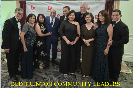
BLD TRENTON COMMUNITY LEADERS